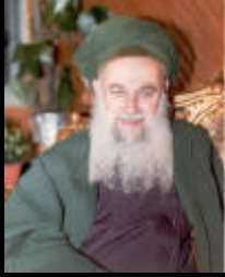
Mawlana Shaykh Nazim Al-Haqqani