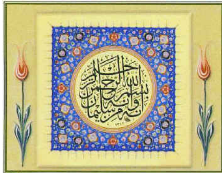
"IT IS FROM SOLOMON, AND IS (AS FOLLOWS): "IN THE NAME OF ALLAH, MOST GRACIOUS MOST MERCIFUL"

Holy Quran 27:30 Bismi Allahi alRahmani ar-Raheem " Inna hu min Suleiman wa inna hu Bismi Allahi alRahmani ar-Raheem "